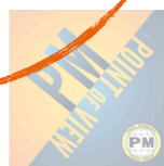
PM Point of View Final Milestone Prod...