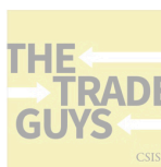
The Trade Guys CSIS | Center for Str...