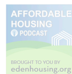
Affordable Housing Podcast Eden Housing