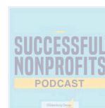
Successful Nonprofits Podcast The Goldenburg Gro...